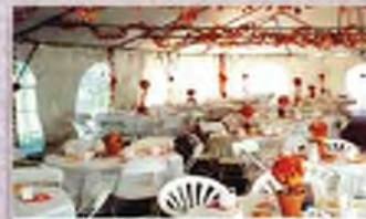
Guests Celebrate Under the Tent