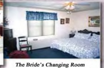
The Bride's Changing Room